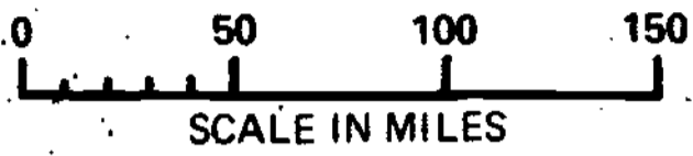
MAP: The Mexicacan - Guadalajara Area