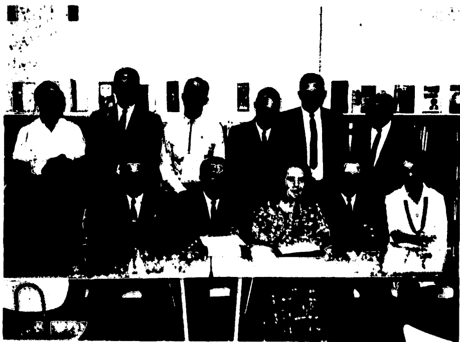
State Department of Education personnel, staff of Carrizozo Schools, and school board members look at the big picture of working to improve Language Arts Program.

State Department personnel assisted in setting up the guidelines and suggested procedures for the reading specialist.