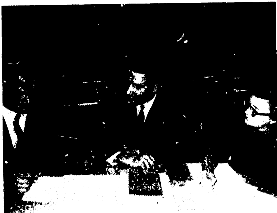
Program objectives were discussed.

this agreement two of the six days were spent in observation of pupils and classrooms and in general sessions with the entire Carrizozo teaching staff. The remaining four days were devoted to work at specific grade levels. Half of each in-service day with teachers at specific grade levels was spent in demonstration lessons conducted by personnel from the Reading Research Center. The remaining half-day was used to involve the teachers in examining materials, developing lessons and/or materials, and discussing techniques and principles of teaching related to the problem of increasing children's comprehension of reading.