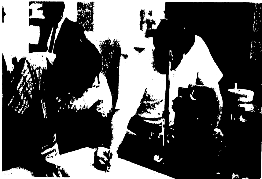
Electronics student being trained with sophisticated technical equipment by supervisor on work station.