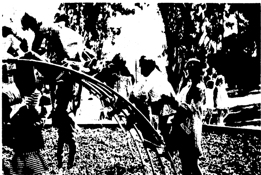
Education student here is helping elementary students on school playground.