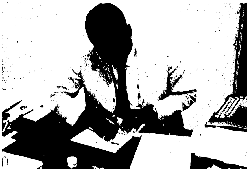
Business student broadens knowledge of communications working in Public Relations Department of electronics manufacturer.