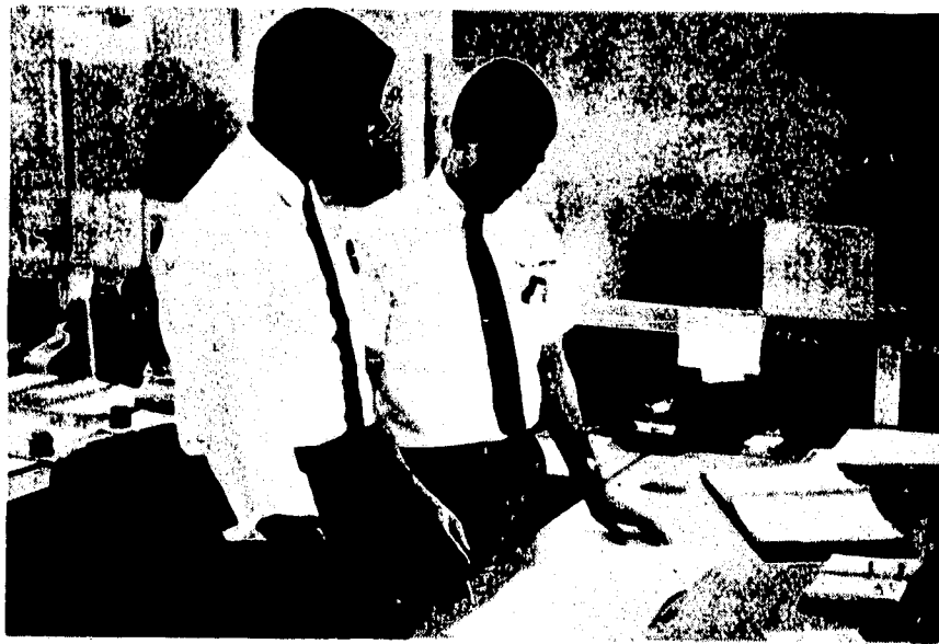
Working for a public utilities firm this Co-op assistant engineer helps design and maintain cable facilities.

More and more firms and organizations have begun to take part in the Cooperative Education program at College of San Mateo, Canada College and Skyline College by employing students. Some participants are: Bank of America, Cal West Electric, General Electric, IBM, Lockheed Missiles & Space Co., Memorex, Micro-Miniature, Owens-Illinois, Pacific Coast Stock Exchange, Pacific Telephone, Palo Alto Times, Pan American Airways, J.C. Penney, Philco-Ford, Sears Roebuck, Shell Data Service Center, Southwestern Publishing, Standard Oil, City, County and Federal agencies, VISTA and many others.