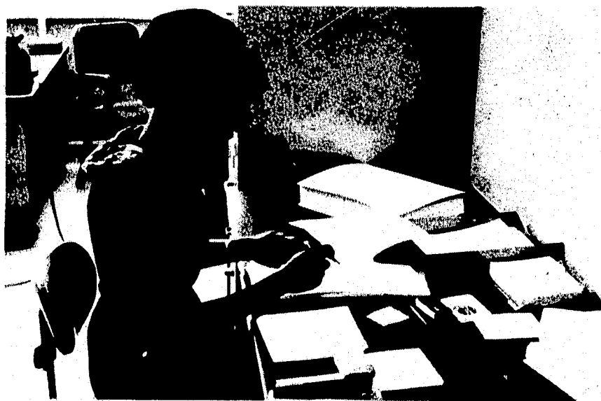
Evening college student prepares work materials in Data Processing Center.