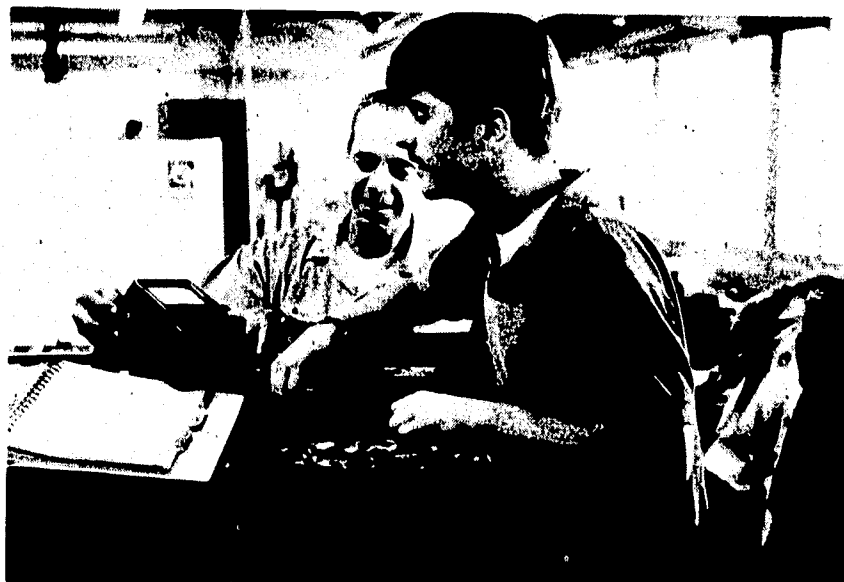
Engineering student puts academic training to work as a major appliance serviceman for large manufacturer.