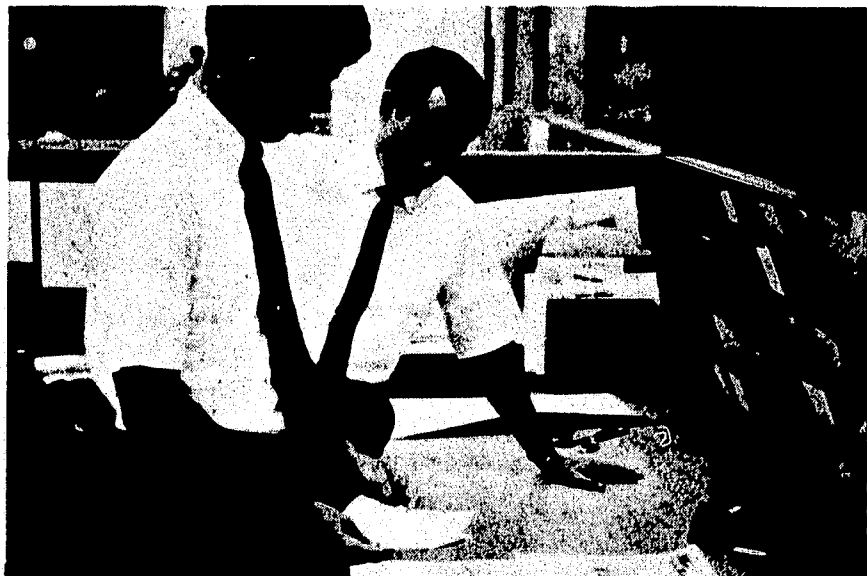
Business major Co-op student works with supervisor in newspaper advertising department.