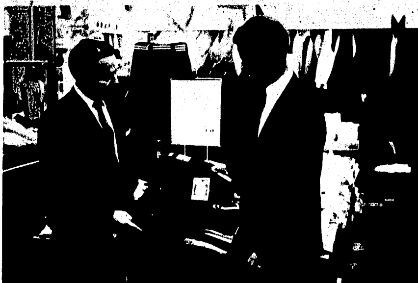
Co-op student gets practical sales training on job from supervisor.