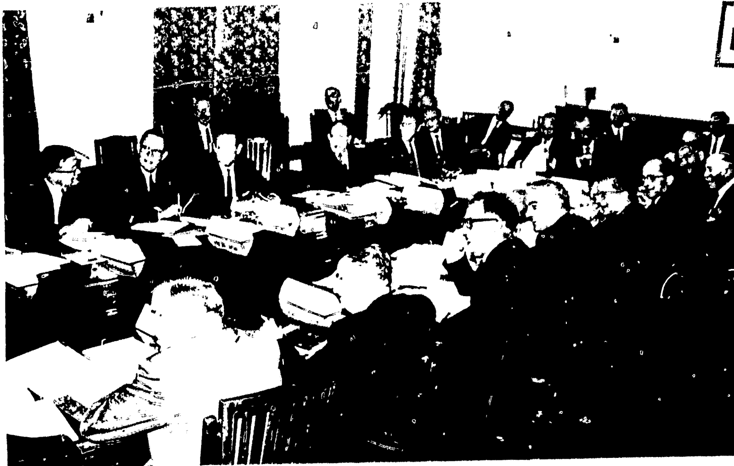
A Light Moment Around the Conference Table