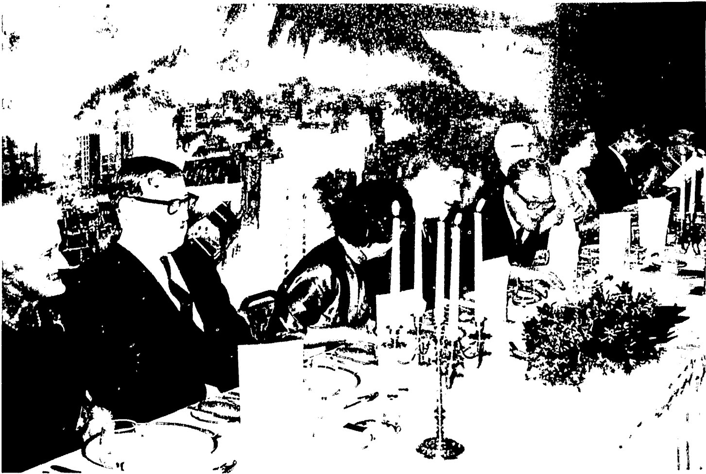
Head Table--The Opening Dinner