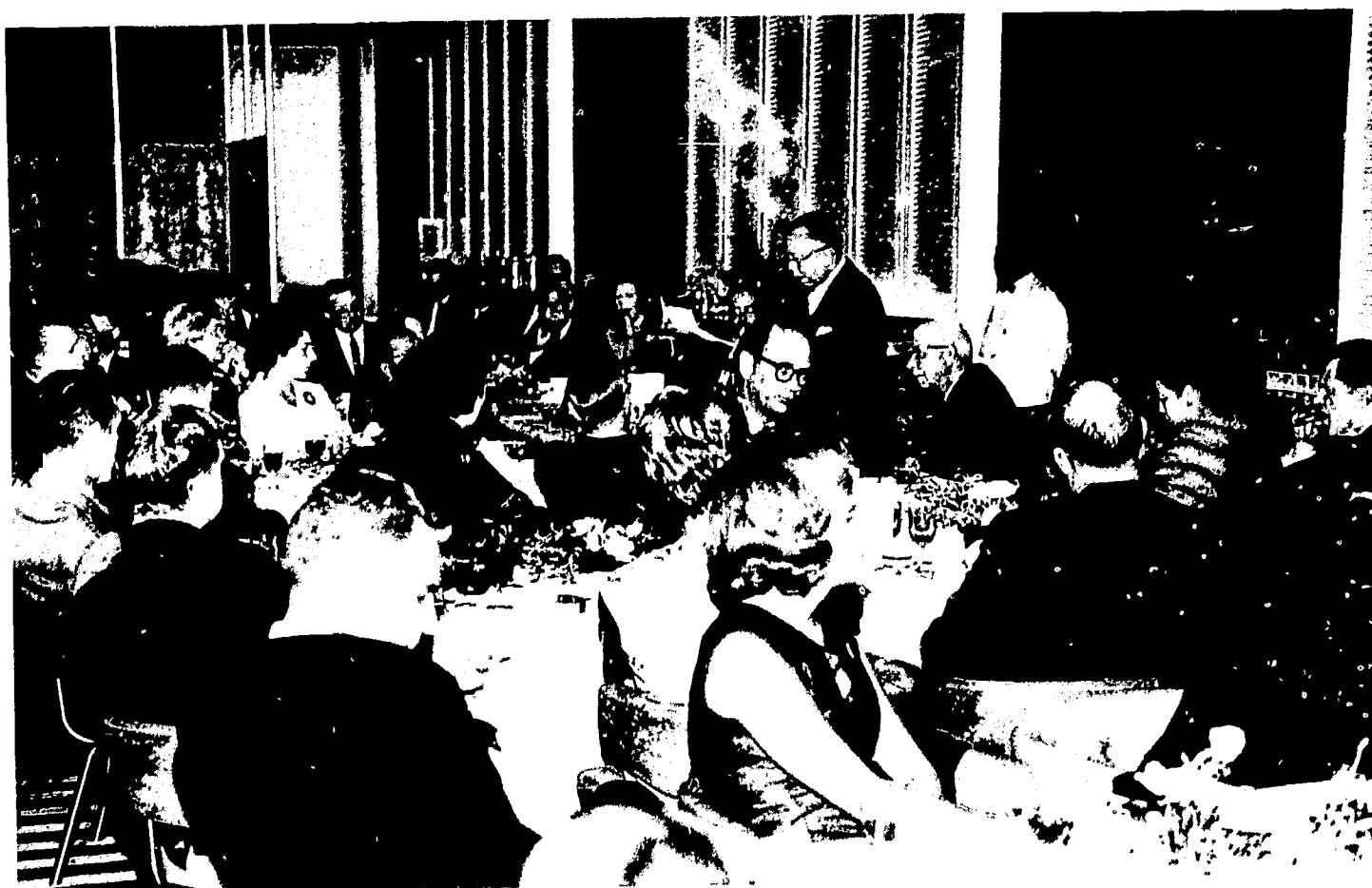
An Attentive Audience at the Closing Dinner