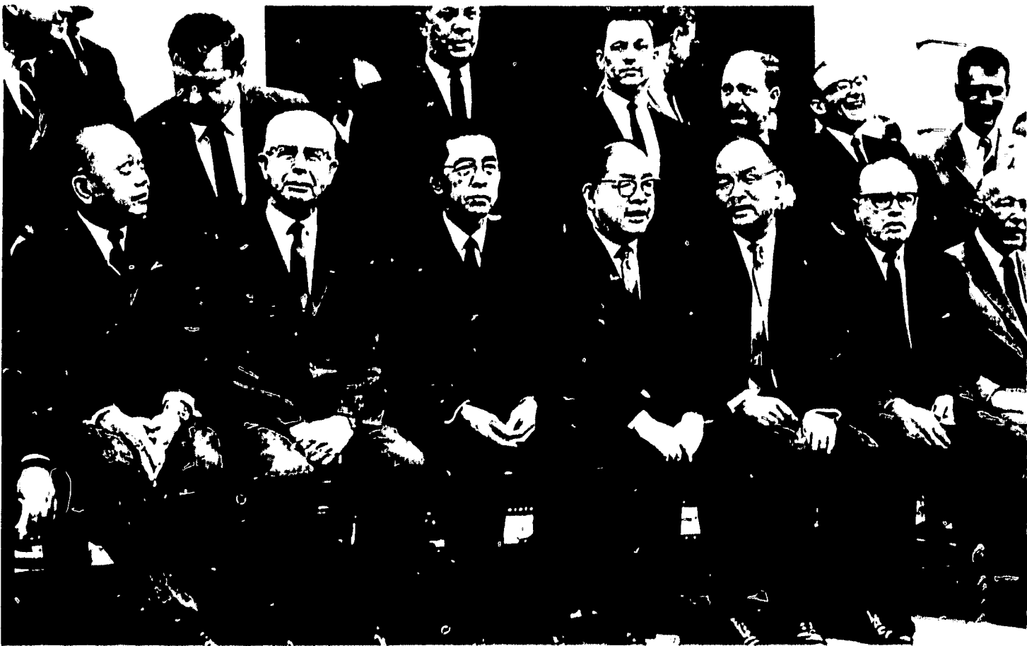
Getting Set for the Conference Photograph