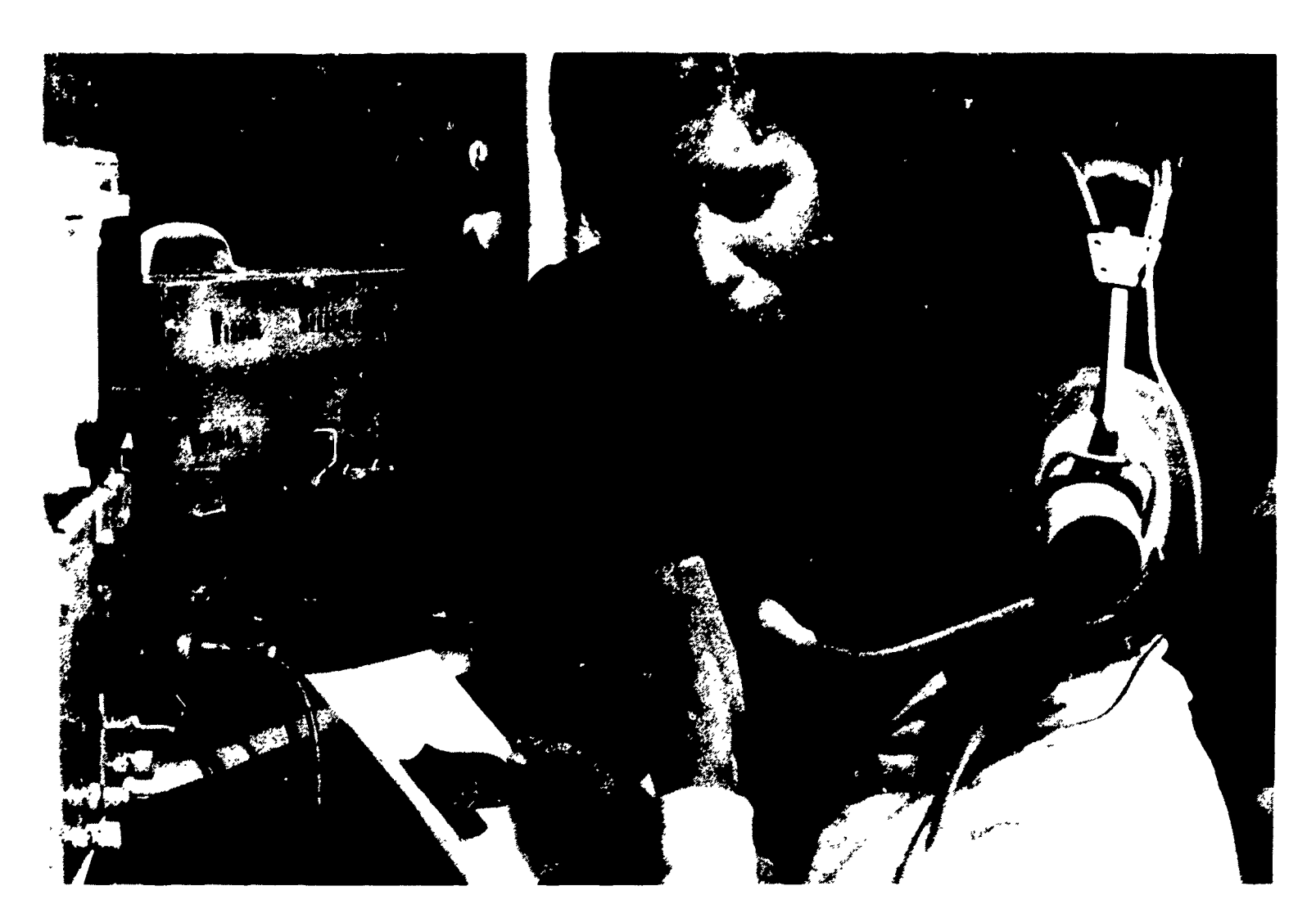
The visual pattern of a pupil's speech appears on analyzer screen for speech training at Kendall School.

nity: (1) Diagnostic and Evaluation Clinic; (2) Undergraduate Audiology and Speech Program; (3) Gallaudet Preschool Program; and (4) Sensory Communication Research Laboratory.