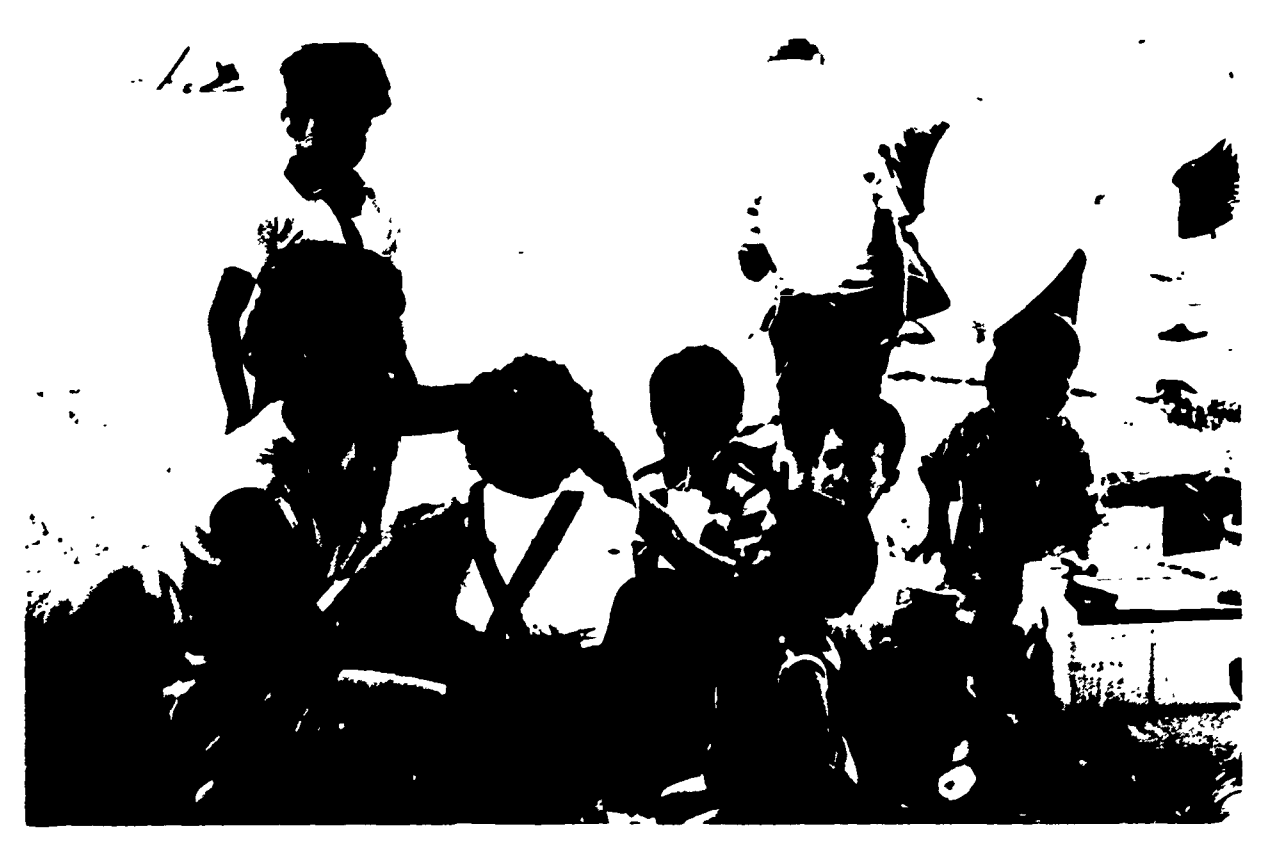
Activities involving mothers are helpful in promoting language development among Gallaudet Preschool Children.

Public Law 90–247 further amended Title I of ESEA to provide increased support for education of children in state operated or state supported schools for the handicapped. Under this law, State agencies receive additional funds for new personnel, instructional materials, and other programs which reach into the state schools to aid the handicapped.