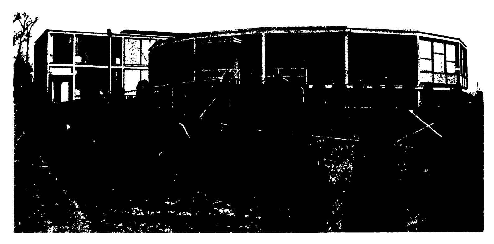
The specially equipped Mary L. Thornberry Memorial Building houses the Hearing and Speech center, the Diagnostic and Evaluation Clinic, the Preschool, the Acoustic Communication Research Laboratory, the Audiological and Speech Program for Undergraduates of Gallaudet College, and the administrative offices of the Graduate School.

Gallaudet also operates the Kendall School, which offers elementary and secondary education to approximately 185 deaf children from the greater Washington metropolitan area, and a pre-school program for very young deaf children.