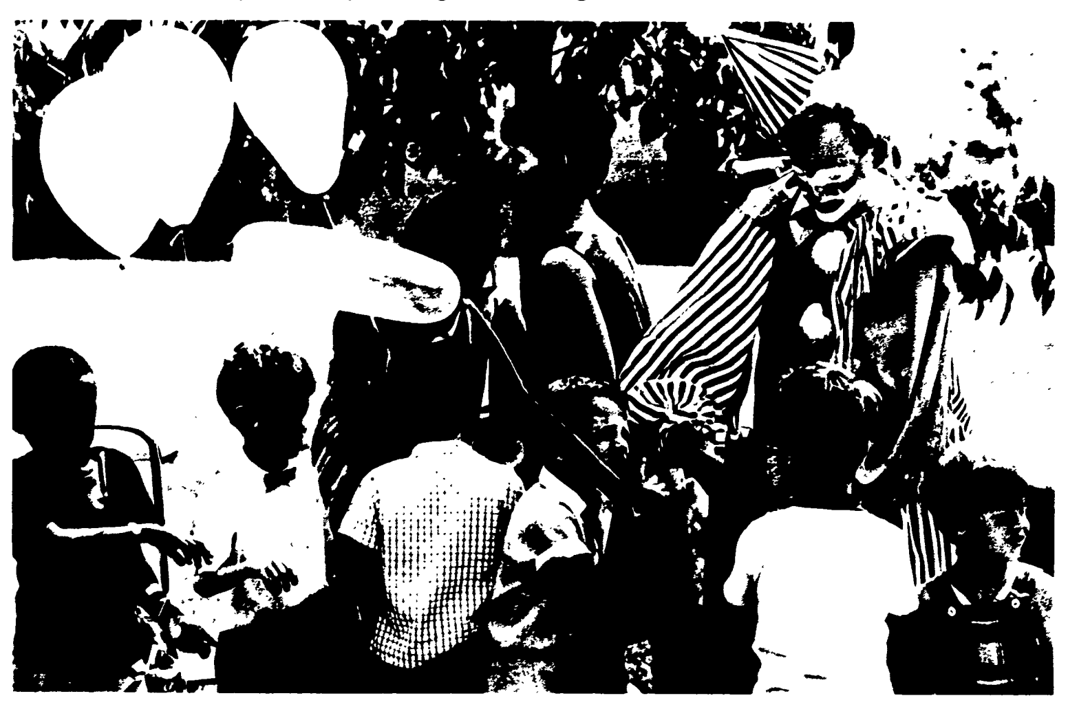
Activities used to promote language development for deaf preschool children are fun as well as instructional.

A thorough and continuing evaluation of the effectiveness of each program assisted under this Act shall be conducted by the Commissioner, either directly or by contract with independent organizations.