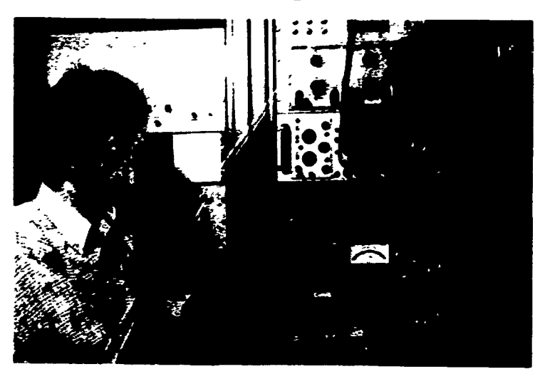
Automatic push-button test of sound quality discrimination is used to explore hearing capacity of deaf listeners. Sensory Communication Research Laboratory, Gallaudet College.

The general purposes of the research and demonstration program under P.L. 88-164, approved October 31, 1963, are: (a) to translate findings of research from the social and behavioral sciences into practical applications for the education of handicapped children and youth; (b) to generate programs and procedures for classroom teachers and education specialists who will make full use of known facts, ideas, and theories; (c) to create educational environments in which the implementation of new