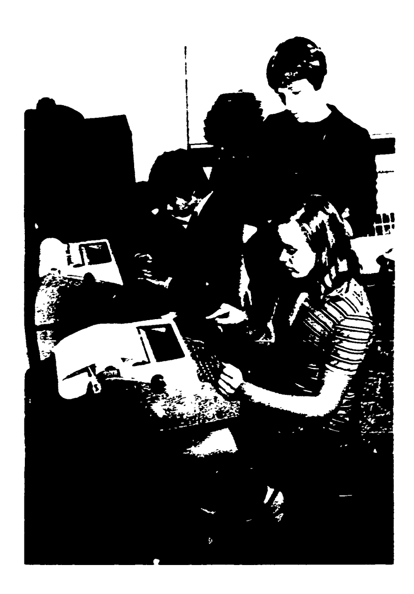
Teacher supervises students participating in the Computer-Assisted Instruction Project for the Model Secondary School for the Deaf.

The High School will be located in Washington, D.C. on 17½ acres of land provided by Gallaudet College on the northern end of its campus. When fully constructed, the students will attend on both a day and residential basis. In ke-ping with the mandate of Congress, the School will be a model in architectural and engineering design. The buildings will be so constructed as to facilitate the use of and accessibility to technological aids, such as computers, closed circuit television, etc. Projects are presently being conducted on an experimental basis on the Gallaudet campus. These include: