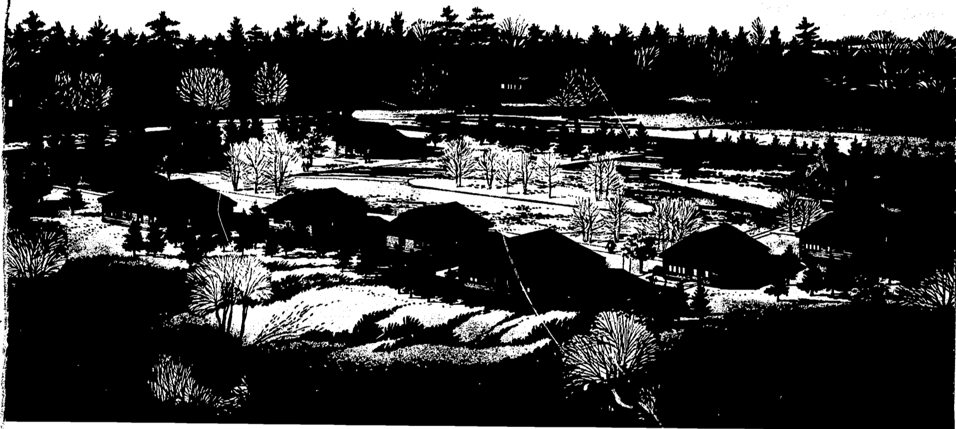
Artist's sketch of the new community at Odanah, Wis. on the Bad River Reservation.