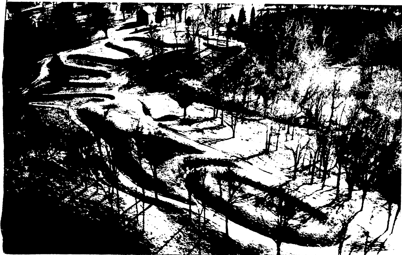
Aerial view of Great Serpent Mound, an effigy mound in Adams County, Ohio, bears witness to an ancient civilization that had passed away long before the coming of European explorers.