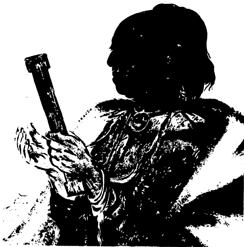
Watercolor of a Kickapoo with his prayer stick by George Catlin, noted portrayer of Indian life (1796–1872). The stick was used as an aid to Christian devotions.

The first major effects of contact with Europeans were cultural changes brought by the French. Stone, wood, and bone weapons, tools and utensils were soon replaced by items