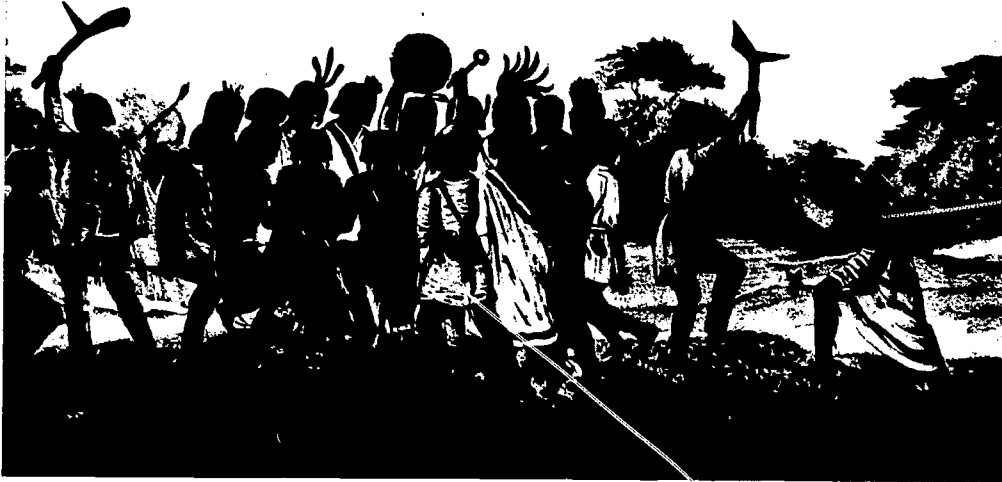
French lithograph of a Chippewa War Dance.

Although they continually raided frontier settlements until the end of the War of 1812, the Chippewas were finally gathered onto reservations in the 19th century and have since remained on lands reserved for them in their original territory in Michigan, Wisconsin, Minnesota and North Dakota. Some small bands of Chippewas sold their lands in Michigan in the 1830's and moved to Franklin County, Kans.