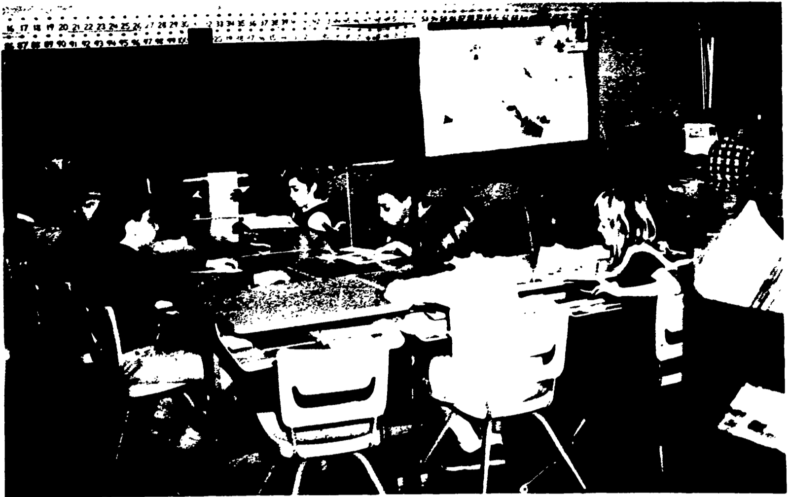
Children of varying abilities were grouped together. Teachers gave extra help to those students who needed it.

year's time. A sixth grade teacher, for example, said about one of her students: