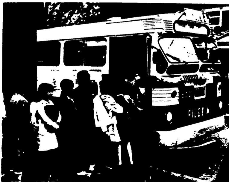
The Syracuse school system chartered city-owned buses to transport the 470 children to their new schools.

Busing. —Syracuse school officials planned in some detail to insure the success of the busing program. Children