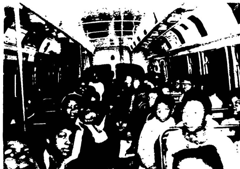
Busing caused few problems for students and school authorities after the first few weeks of the program.

Parents and principals reported some confusion the first few days over bus stops and routes. Negro parents were particularly concerned about disciplinary problems on the buses during the first several weeks of the new school year. As time passed, however, the parents reported that their children adapted to the ride and disciplinary prob-