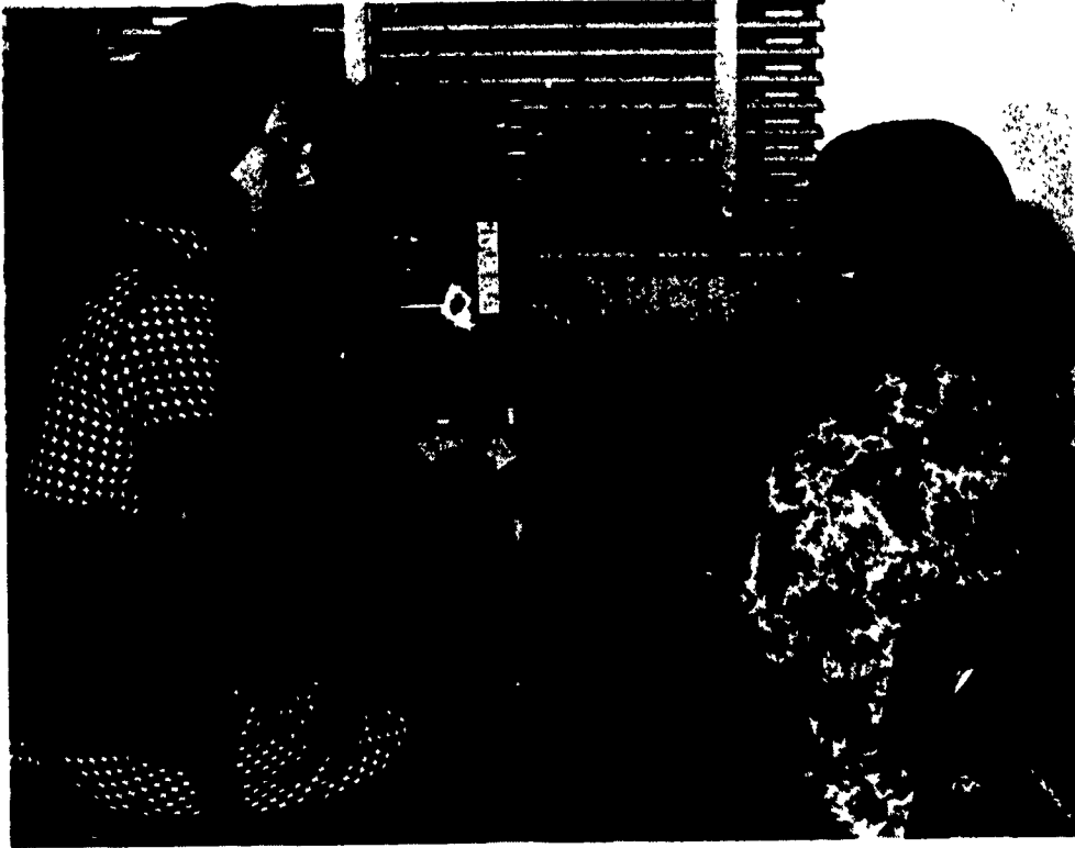
Use of electronic visual pitch indicator in training of voice control.

"... In Title I, Section 205(a)(1), where reference is made to programs and projects which are designed to meet the special educational needs of educationally deprived children and with respect to the number of educationally deprived children in the school district who attend non-public schools in section 205(a)(2), the term 'educationally deprived children' in our opinion includes handicapped children as that term is defined in Title III of Public Law 88-164, approved October 31, 1963." 1/