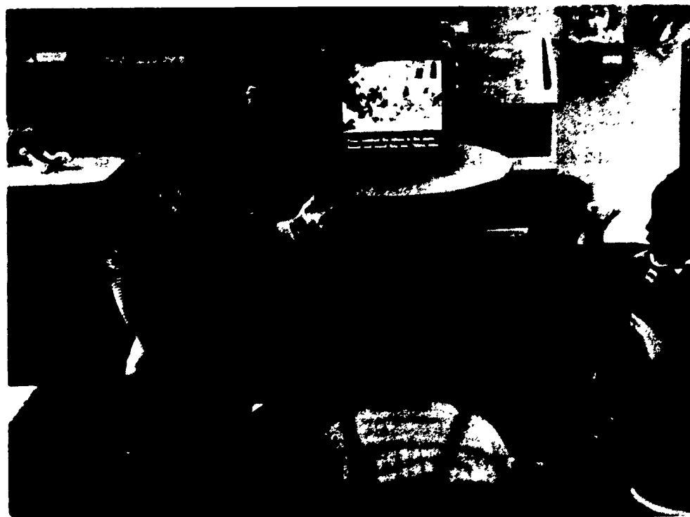
Teacher Using Captioned Films for Instructional Purposes

the deaf, production and distribution of educational and training films for the deaf, and training of persons in the use of films for the deaf.