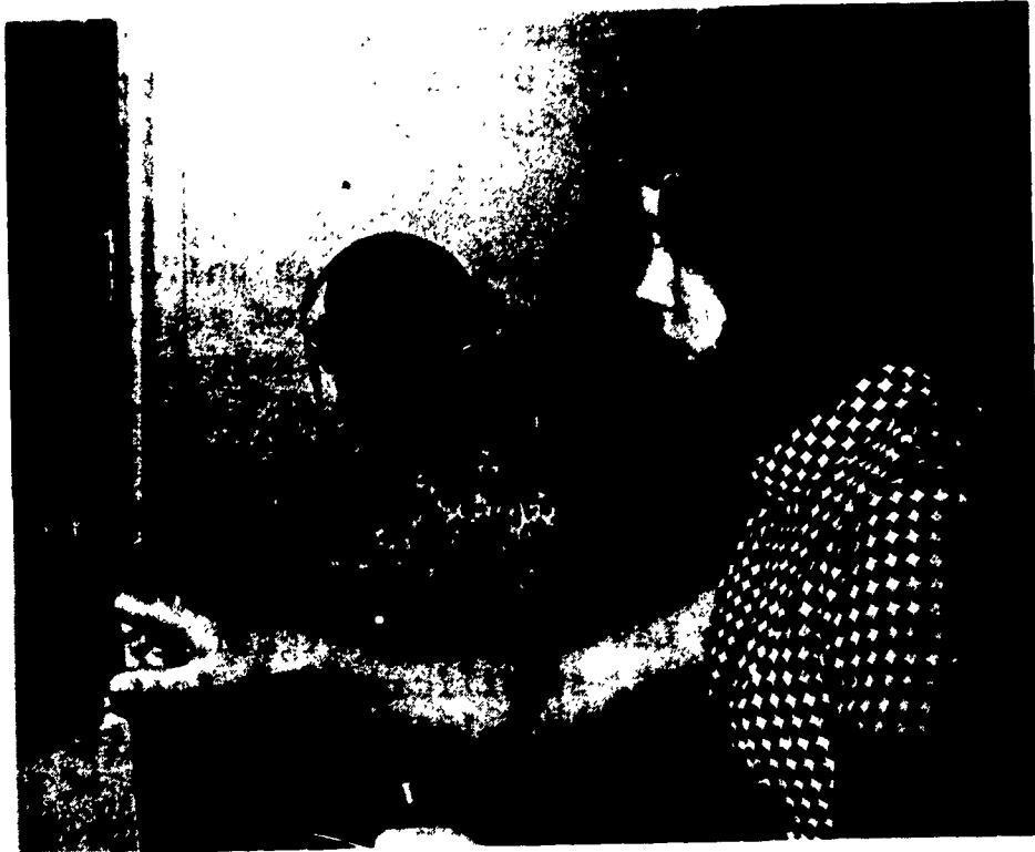
Visual aids supplement auditory training in the development of speech and language at Kendall School, Gallaudet College.

The general purposes of the research and demonstration program under P.L. 88-164, approved October 31, 1963, are: (a) to translate findings of research from the social and behavioral sciences into practical applications for the education of handicapped children and youth; (b) to generate programs and procedures for classroom teachers and education specialists who will make full use of known facts, ideas, and theories; (c) to create educational environments in which the implementation of new programs, procedures, and processes may be demonstrated; and (d) generally to improve the education of handicapped children and youth through innovations in learning situations as well as in classroom procedures, methods, and materials.