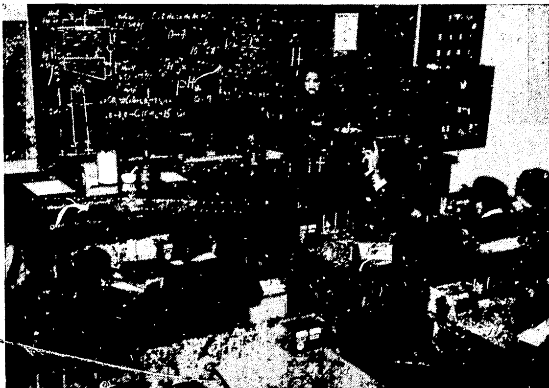
Practical Work in the Chemistry Laboratory

ress in their professions, to continue their studies or to establish their position in society. We establish, and assist in the establishment, of institutions for the preparation of students for the external preliminary and matriculation examinations. Evening secondary schools are run in cooperation with our Department, local authorities and the GFL.