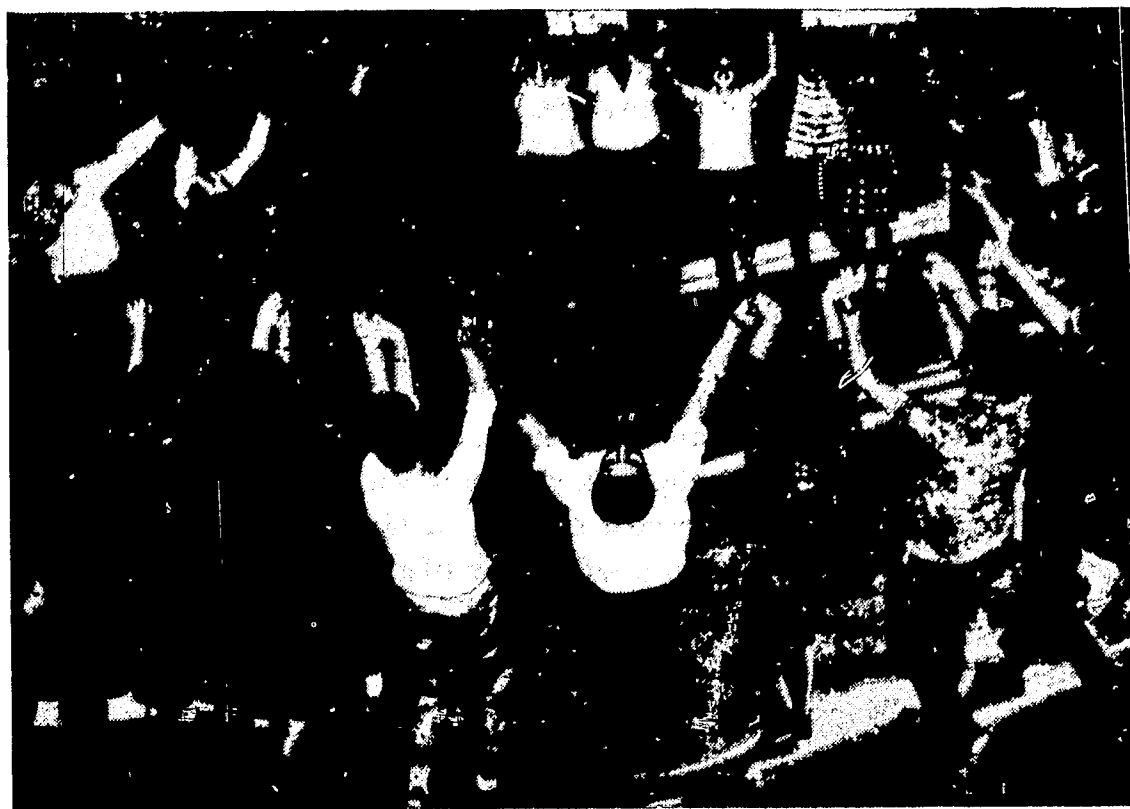
Dance Group Leaders in Training — Rosh Pina Studio

Further, we will not rest or relinquish our ambition (which has, so far, encountered both objective and subjective obstacles) to make it possible for every worker able and willing to do so, to obtain a higher diploma education by correspondence as is customary in various countries. We must be prepared to make resources available for assistance in the execution of such a project when the time is ripe.