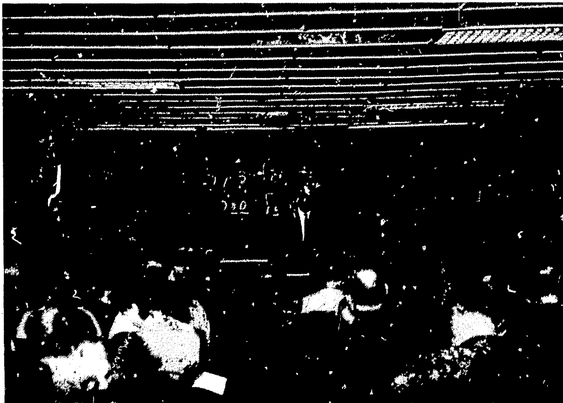
Language Improvement Class at the Tel Aviv Popular University

I entered some of the classrooms. In the art class there were 15 students, all of them amateur artists, and they were painting in oils. All of them — the grandmother, the sportsman, the housewife and the clerk — share their enthusiasm for study. In the Hebrew class, the level of which is post-Ulpan, I saw two doctors, office employees and workers, learning the finer points of Hebrew usage. In the home economic class, the students, mostly young newly-weds, learn how to run a home, and how to draw up a household budget. They visit household goods, electrical and furniture stores, and are taught how to use kitchen utensils and how to furnish a house."**