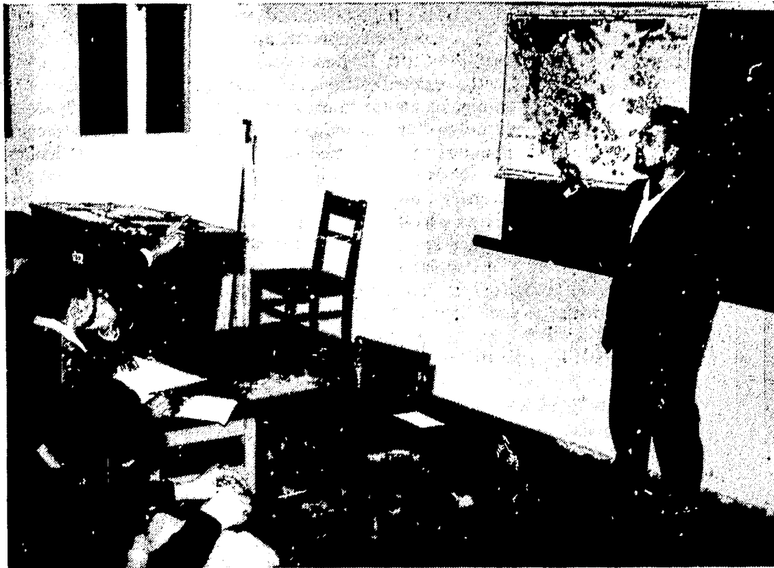
Geography at the Be'er Tuvia Regional Popular University Centre

Such centres are generally held in the regional school. A visit to one of them leaves an impression of a hive of activity on the part of a public thoroughly enjoying itself. Students are taken to and from the centre in buses and trucks. Great care is needed in the organisation of the centre, and the studious atmosphere of the institute is ever-present. The villages and regional councils have learnt much from this experience. Today, one can observe how detailed planning, energy and organisational ability brought a blueprint from the planning table to reality. All parts of the school building become a throbbing centre of learning, night as well as day, and the surrounding area is filled with beneficial intellectual activity during the evening hours. Responsibility for organisation, provision of buildings, and transport devolves upon the regional council. Planning, and the financial burden, are shared by the region, the Department and the Cultural Division of the GFL.