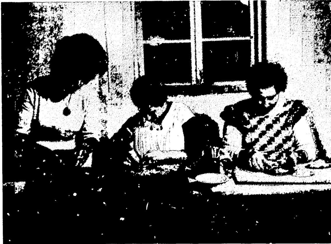
Amateur Ceramics Enthusiasts in Rehovot