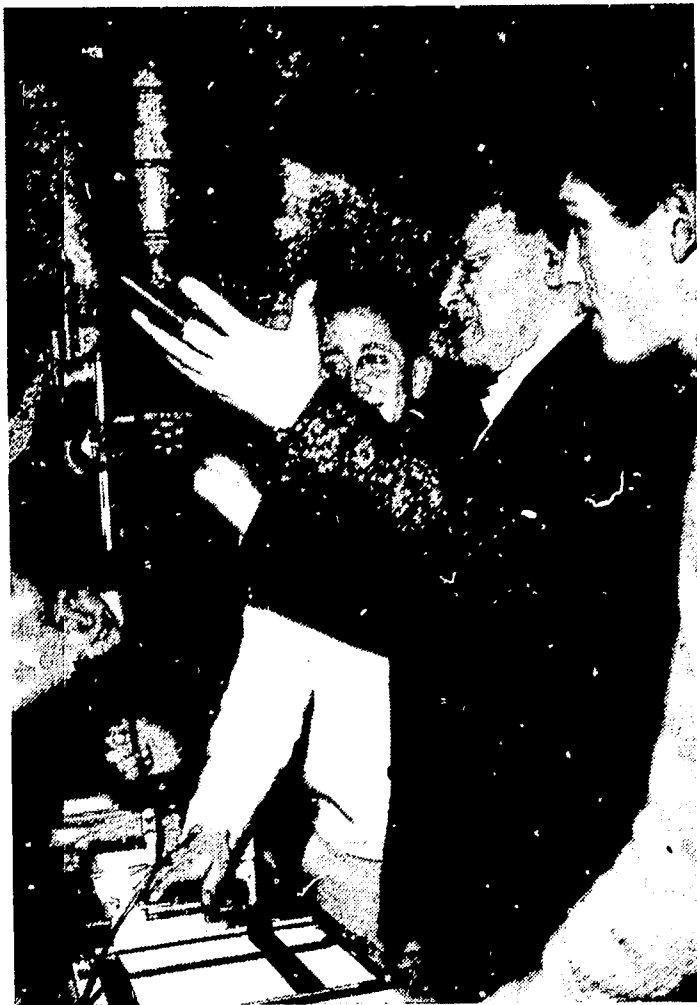
Photography Enthusiasts in Benyamina