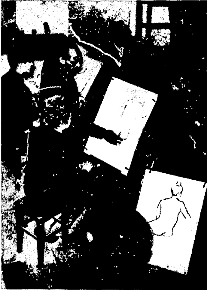
Drawing Lesson at the Popular University, Ramat Gan

Magdiel, Mabu'im, Ashkelon, Sha'ar-Hanegev, Tiberias and elsewhere can display a colourful exhibition of paintings and decorated pitchers, copper work, baskets, lampshades, bags, vases, frames, dolls, table cloths, woven rugs and so on — all the fruits of their labours.