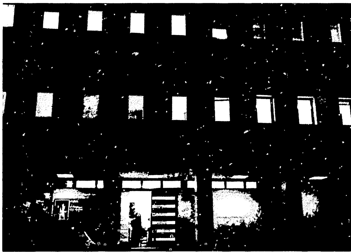
The Popular University in Beit Ha'Am in Jerusalem

1. Popular Universities or Institutions for Further Study in Jerusalem, Tel-Aviv Haifa and Beer-Sheva are organised as evening colleges providing a high level of education. The year is divided into two terms, together of 25 — 30 weeks' duration. The winter term lasts 5 months and the summer one 2½. The number of study hours is 50-60 per year, two hourly periods of instruction being given once a week. In 1965, 196 classes attended by 5,200 students were held. The distinguishing characteristic of the Popular University is that it can offer the student a varied range of subjects and occupations. The groups are directed by qualified members of the appropriate professions. Thus, a high standard is ensured, and study is systematic, continuous, and uninterrupted from year to year.