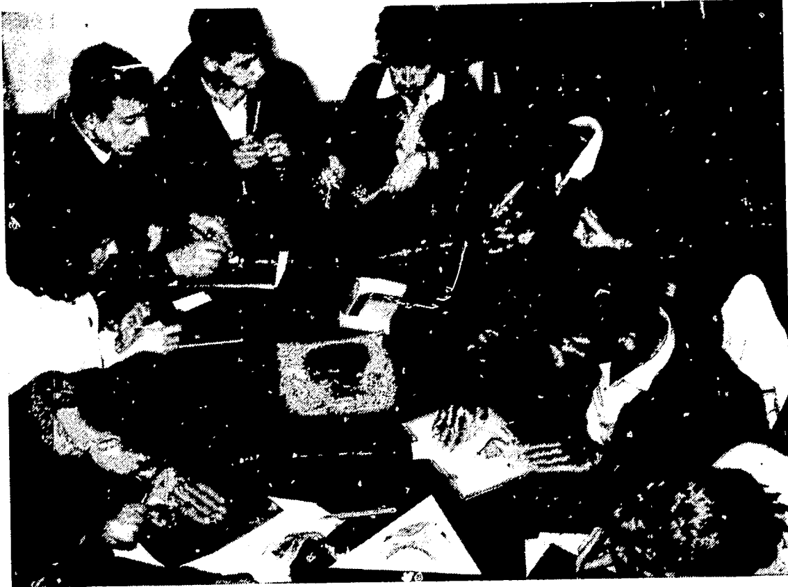
Regional Handicraft Group, Emek Hefer