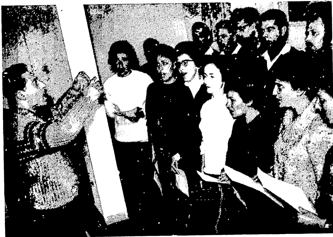
Upper Nazareth Singing Group