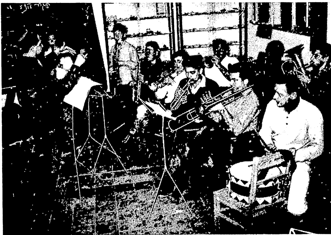
Amateur Orchestra in Training