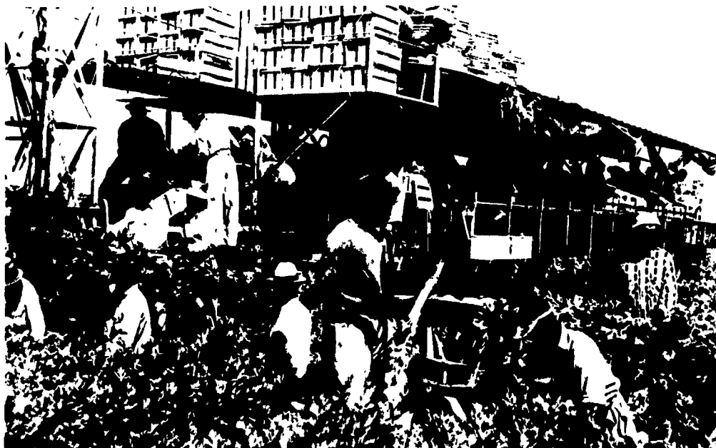
A factory in the field