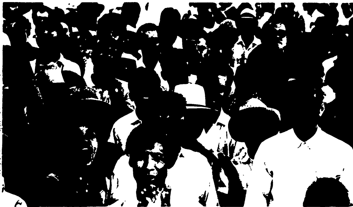
Striking grape workers