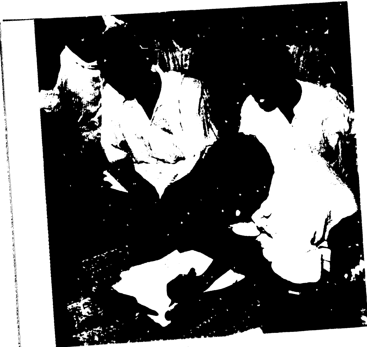
Adult literacy class for men in Madras.

Evening literacy class for women in Mysore; during the day, the instructor works for the State Education Department. For this extra-curricular work, she receives a fee from the Mysore Education Council.