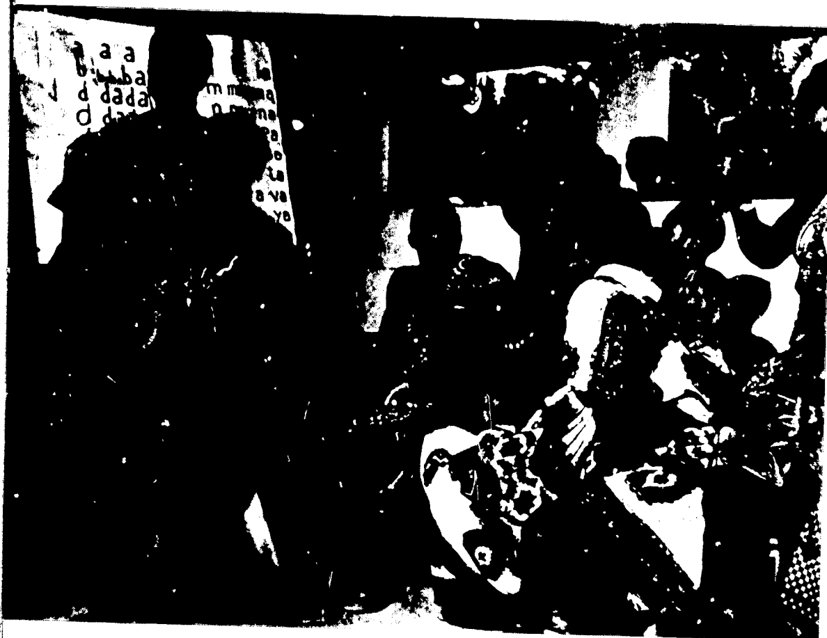
A lively class in Kumase, Ghana.