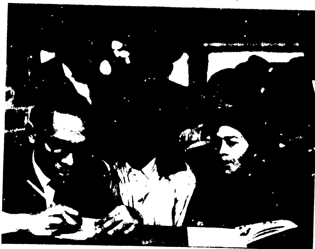
Evening reading and writing classes in the vicinity of Bogota, Colombia. The instructor teaches 10-year-olds in the city during the day.