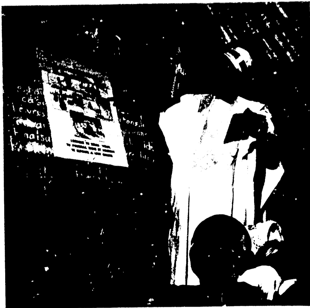
A literacy class for adults in Boreko, Guinea.