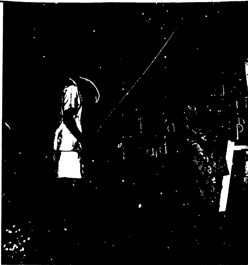
A teacher reviews the progress of one of his students in Tchkpo, Togoland.