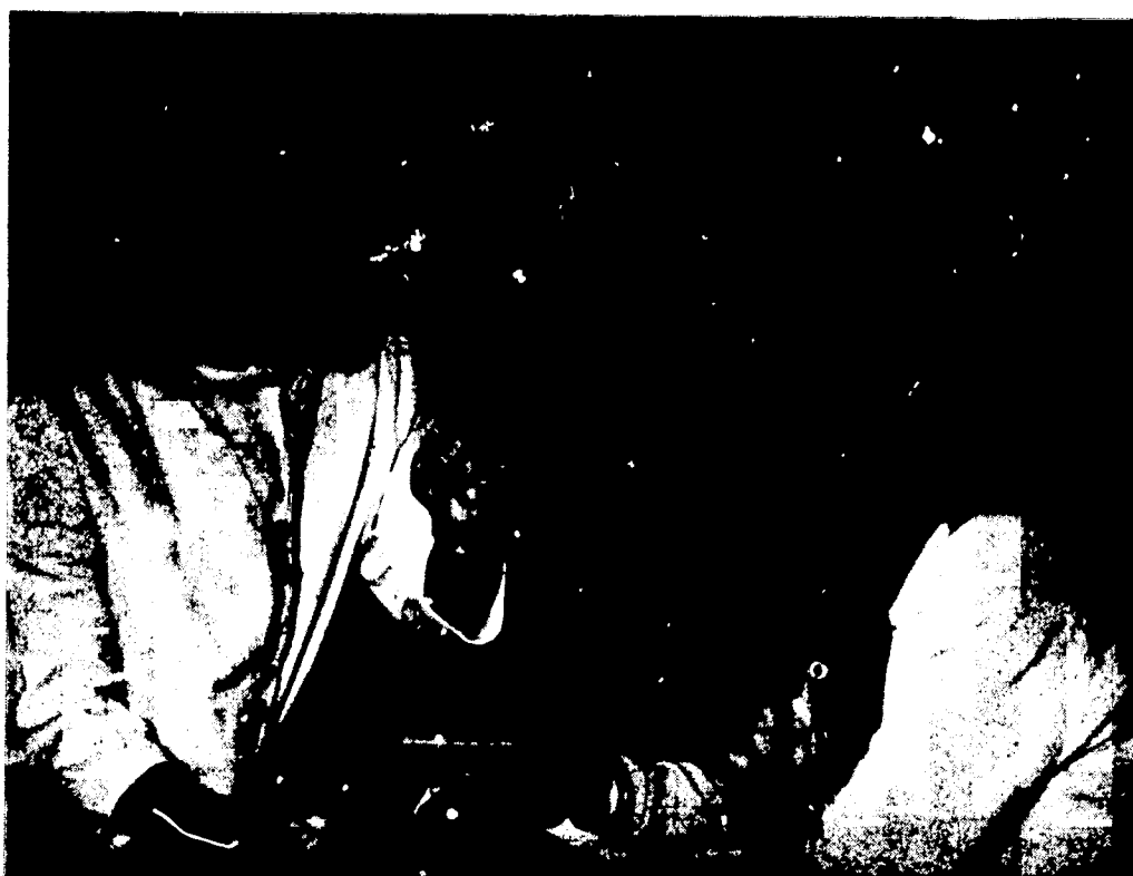
Literacy for women: a class in Carthage, Tunisia.